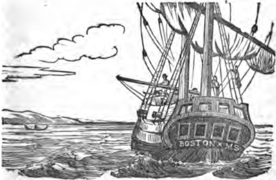
The arrival of the Boston, at Nootka Sound.

with the ship about five miles to the Northward of the village, which is situated on Friendly Cove, and sent out his chief mate with several of the crew in the boat to find a good place for anchoring her. —After sounding for some time they returned with information that they had discovered a secure place for anchorage, on the Western side of an inlet or small bay at about half a mile from the coast, near a small island which protected it from the sea, and where there was a plenty of wood and excellent water. The ship accordingly came to anchor in this place, at twelve o'clock at night, in twelve fathom water, muddy bottom, and so near the shore that to prevent the ship from winding we secured her by a hauser to the trees. On the morning of the next